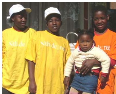
Children at the 20th Anniversary celebration of Othandweni

Othandweni Childrens Home Johannesburg Life-saving services for abused, abandoned and neglected children in the communities